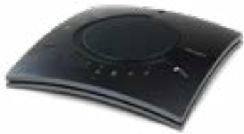
CHAT 150 Unit