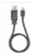
USB 2.0 Connection Cable