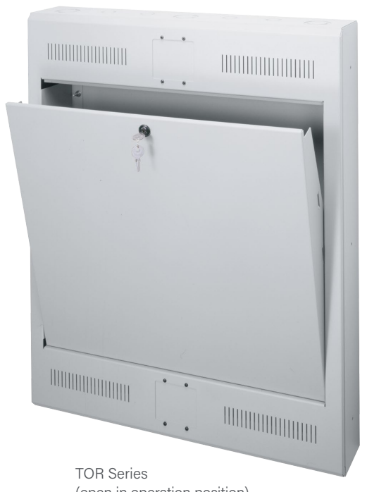
(open in operation position)