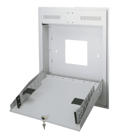
(open in service position)