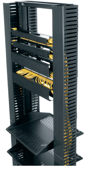
PCD shown on RLA series 2 post rack